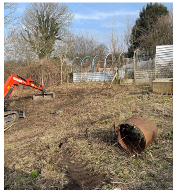
Progress - Feb 2025