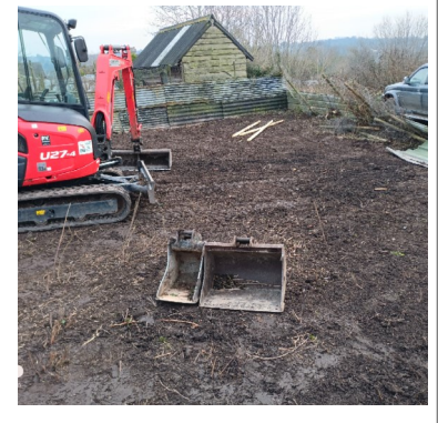
Clearance nearing completion

www.daltontowncouncil.gov.uk 01229 464000