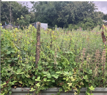
Before - July 2024

Work is continuing on the creation of a community orchard. The Town Council took over the tenancy of one allotment late last year and considerable clearance work was needed before plans could be drawn up for the layout. Work has been continuing on the clearance and rubbish removal although at a slower pace due to the winter weather. 14 tons of waste have been removed from the plot so far. Recently Cllr Bruce Solari attended the site and measured up so work can now begin on planning the paths, tree locations and wildlife area.