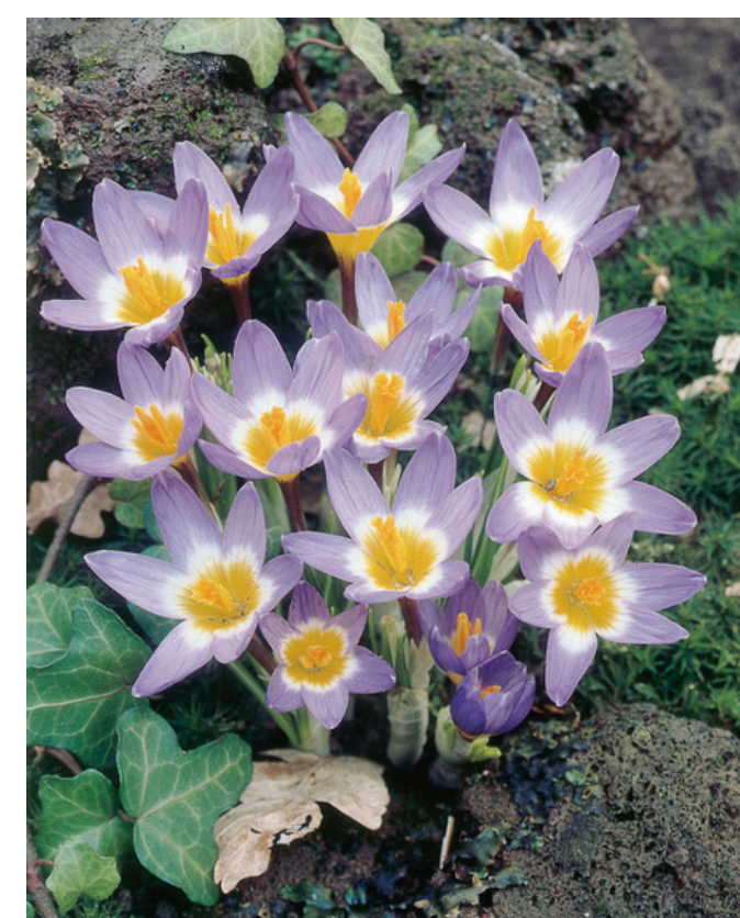
Crocus Sieberi Tricolour

Councillors and council staff joined forces in November to plant an array of spring bulbs in preparation for a vibrant spring. The planting took place across several key locations, including the Rusland Drive planters, both mining carts on Market Street, and the Bee Garden.